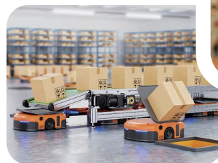
Autonomous Mobile Robots