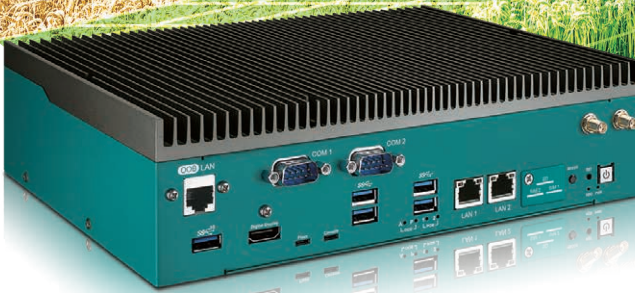
Automated Agricultural Machinery