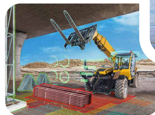
v Construction Automation