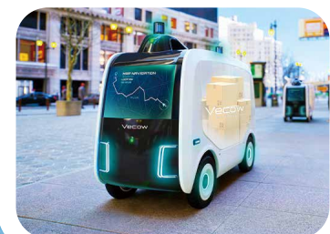
^ Mobile Robotics